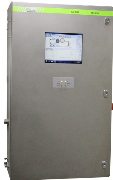
Model: C24000 Wall-mounted version