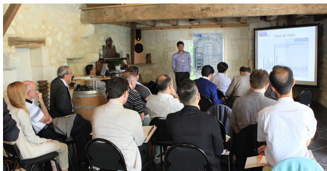
Commercial training in July 2014, Saint-Antoine

Sales and technical seminars were held recently in Chromatotec®'s headquarters in Saint-Antoine in France last July and in Beijing last September. It was a successful meeting with more than 30 distributors joining us during those days.