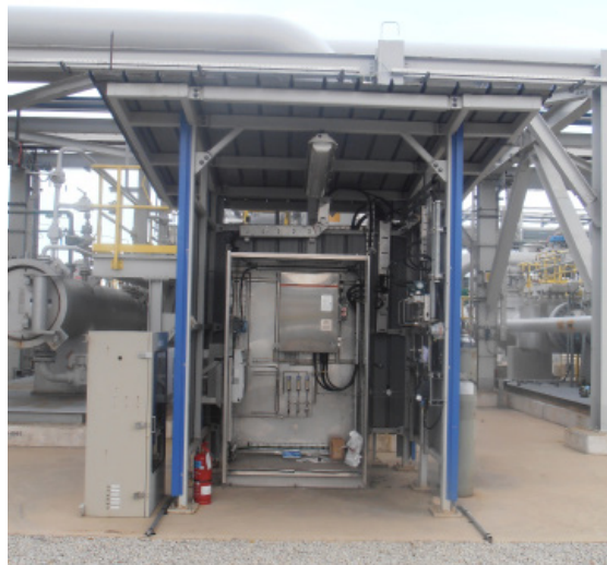
Medor® Exp in explosive area : LNG port

for impurities in pure gas and chromENERGY for C1C6+ and calorific value. Due to its new improvements, Chromatotec® provides a full analytical solution for natural gas monitoring in hazardous area.