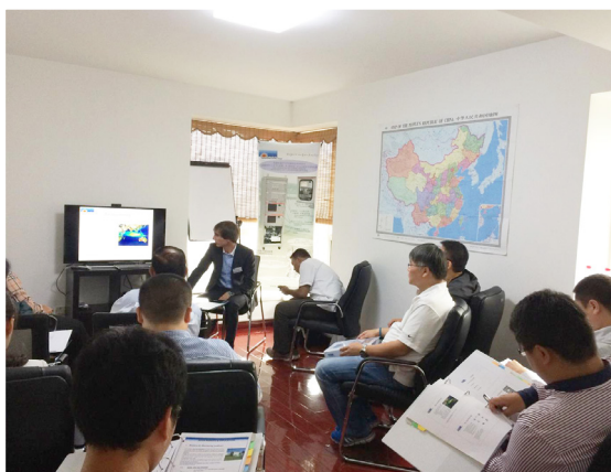
Technical training in September 2014, Beijing office

We also took this opportunity to present our latest development regarding odor and chemical monitoring. It warns users when levels of concentration exceed defined values at the source or in the Environment.