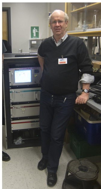
airmOzone at US EPA laboratory

US EPA has purchased one airmOzone system from Chromatotec® for the field evaluation phase. The 3 systems selected will be placed in a mobile laboratory to be moved to the different monitoring sites. The test plan consists in a four months evaluation, one month in each