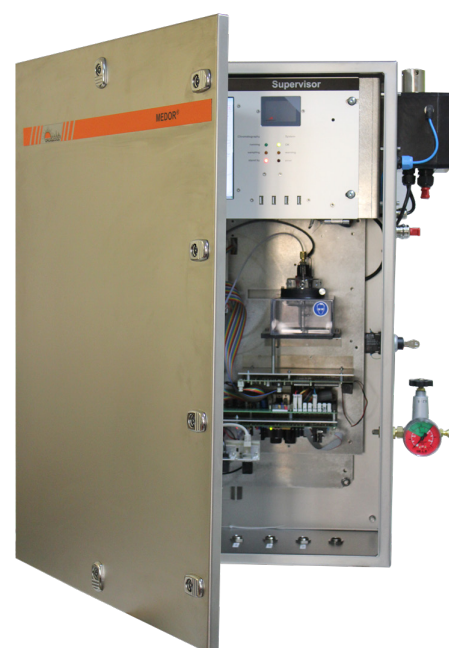
MEDOR® Exp analyzer

Due to its new improvements, Chromatotec® provides a full analytical solution for natural gas monitoring in hazardous area.