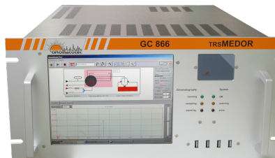
vigiNOSE analyzer (TRSMEDOR® & PID)

This solution already deployed in the United Arab Emirates will be deployed on a sewage in Poland to confirm the acceptance of this full turnkey solution.