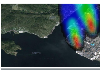
Odor & chemical dynamic plume