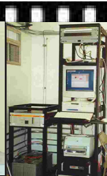
American Cabinet 2000