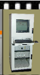
MEDOR EX in Exp Box 2009