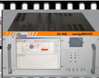
energyMEDOR 5U - 2007