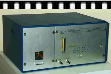
American MEDOR - 1997