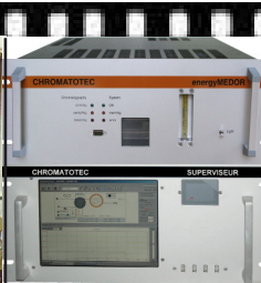
energyMEDOR 4U with its supervisor 5U - 2005