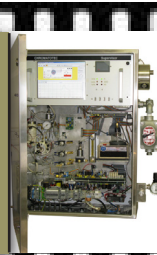
MEDOR in Philadelphia, PA - 2009