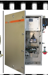
MEDOR® Exp 2015