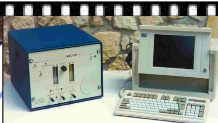
MEDOR 8000 - 1985