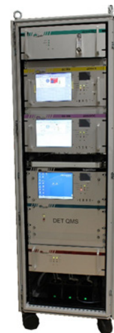
Auto GC 866

This solution can be easily implemented near industrial sites where an important quantity of compounds can be emitted and can be found in ambient air. This global solution offers double check measurement to ensure accurate identification in spite of possible coelution effects. To get a complete finger print of the area, it is also possible to add to this complete and scalable solution an analyzer dedicated to the measurement of Total HydroCarbons and an analyzer for the measurement of sulfur compounds.