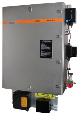
Analyzer with internal calibration

It is available with dedicated configuration for safe and hazardous areas: ATEX, IECEx, CSA and CSA international certifications for its application in refineries and petrochemical plants.