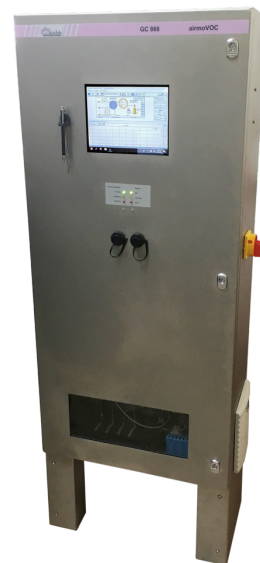
airmoVOC WMS Water monitoring system

The airmoVOC WMS is used in the water markets of the food processing, pharmaceutical, cosmetics and perfumery industries, as well as in the analysis of drinking water, beverages, surfaces, and liquid, consumable products (e.g., milk, soda, wines, spirits, etc.).