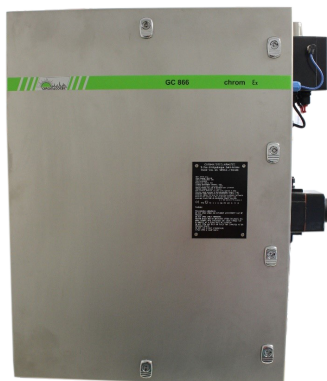
Chroma Ex analyzer in wall-mounted box

It is available with a custom configuration for safe and hazardous areas: ATEX, IECEx, CSA and CSA international certifications for its application in refineries and petrochemical plants.