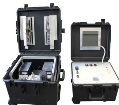
Aldehydes and Ketones AIRMOHPLC