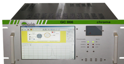
Green House gases chromaCO - CH 4 , CO, CO 2 chromaDID - N 2 O/CO 2

AMERICA / US CHROMATOTEC Inc. Houston - USA