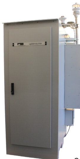
A/C Shelter Custom cabinet for Chromatotec analyzers