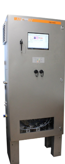
Process GC Wall mounted cabinet

Fenceline monitoring of any targeted VOCs with standalone solutions