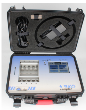
Portable 4 ways sampler system to collect sample on sorbent tube for laboratory analysis