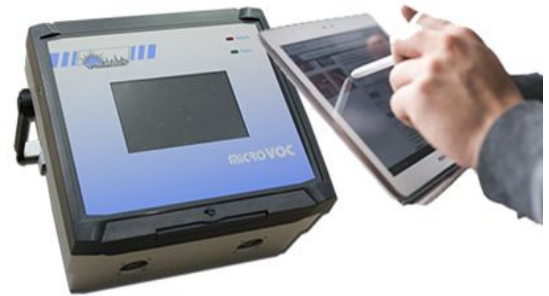
\mu -airTOXIC BTEX