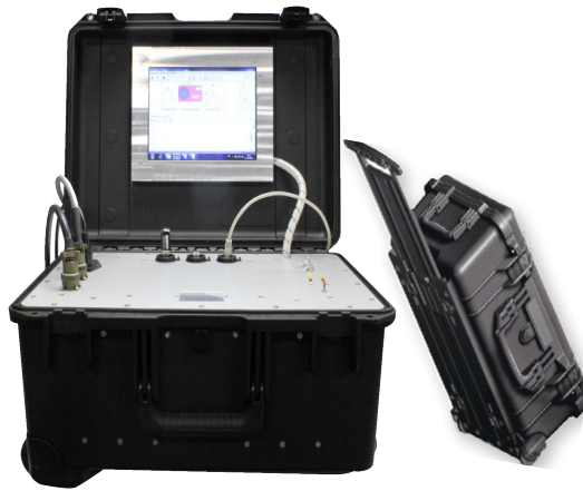
Integration in hard foam case with battery and gas cylinder

Based on airTOXIC-Approved and installed by US EPA