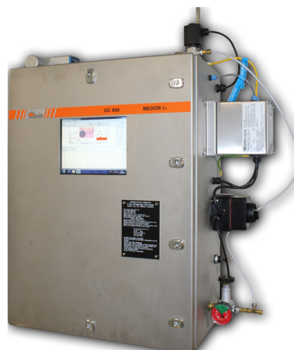
Model: A73022 Exp